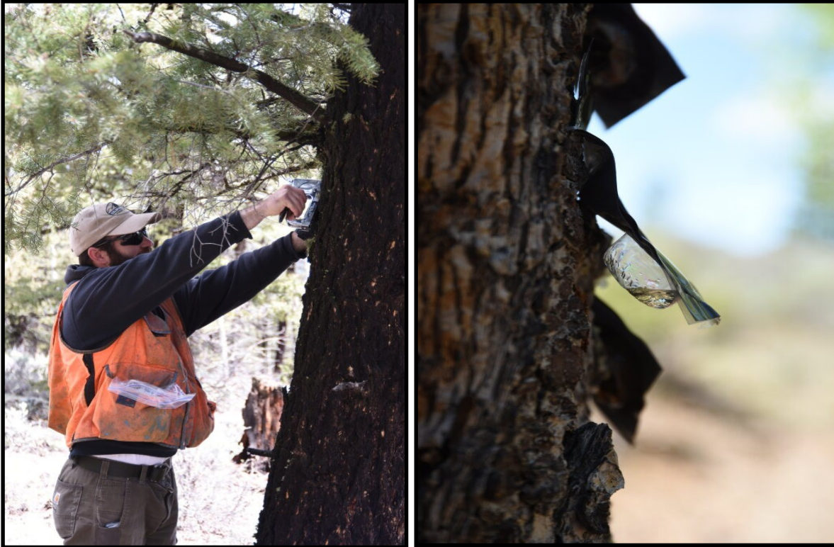
Bubbles should be stapled to the north facing side of the tree, bubble side facing down.