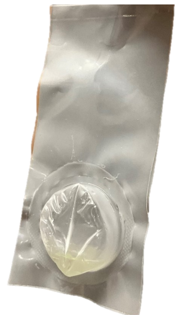
MCH bubble, packaging color varies between production years.

MCH is packaged in a semipermeable plastic bubble that releases the product into the environment over time to create a “pheromone plume” around your property. Each bubble contains 1000 mg of MCH, and can be applied to protect individual trees or in a grid pattern in stands containing a significant number of trees.