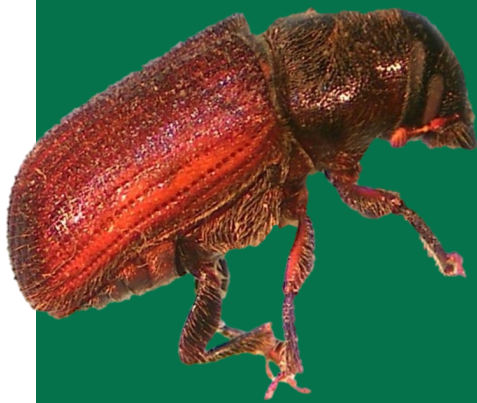
Spruce beetle ( D. rufipennis ), actual size 4.4mm-7mm.