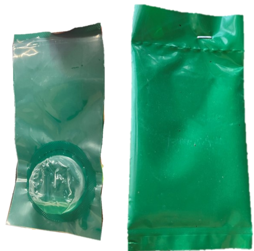
Verbenone pheromone packets are sold as bubbles (left) & pouches (right).

Verbenone is packaged in a semipermeable plastic that releases the product into the environment over time to create a “pheromone plume” around your property. Verbenone packets are sold in two different forms (pouches & bubbles), which vary in cost and application to maximize effectiveness and help individualize protection strategy depending on the acreage, number of trees, and specific landowner goals.