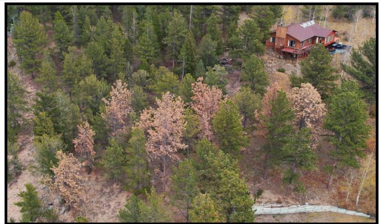
Group of pine trees fading following successful mountain pine beetle attack.

Following a successful attack, pine needles will turn yellowish to reddish in color and begin to fall from the branches. This usually occurs the second summer after the attack.