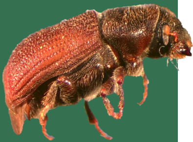
Mountain Pine Beetle, actual size 3.5-6.8 mm.

FAQ's About Protecting Pine Trees from Mountain Pine Beetle