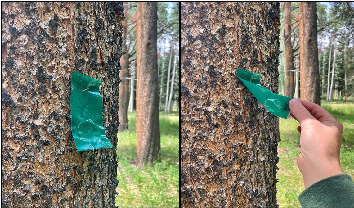
Verbenone bubble stapled to the north-facing side of the tree, bubble side down.