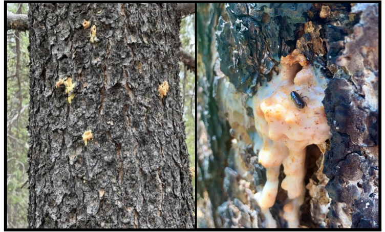
Pitch tubes on a lodgepole pine (left). Beetle being pitched out of a ponderosa (right).

Infested trees usually have several popcorn-shaped masses of resin around the trunk where beetles have tunneled into the bark. However, pitch tubes may not be present in years with below average precipitation.