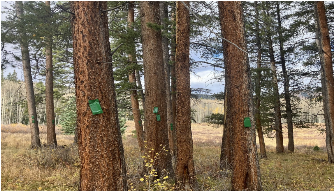
Verbenone packets in a residential community near Gunnison, CO.

Unfortunately, Verbenone is only effective when used preventatively. Once a tree is mass-attacked, there is little that can be done to save the tree. Verbenone should be placed on surrounding trees, but removing any infested trees or slash should be prioritized.